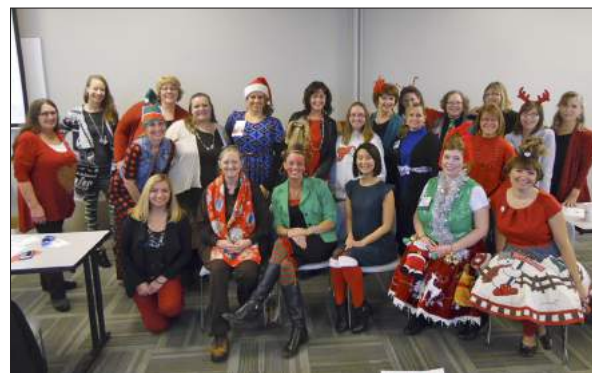
Working with Women Holiday Party