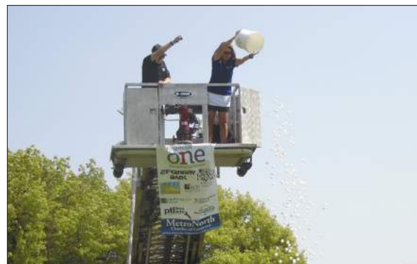
Ping Pong Ball Drop at Golf Tournament