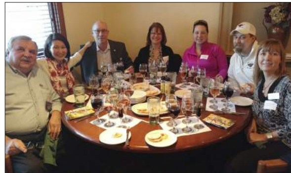
Olive Garden Wine Dinner