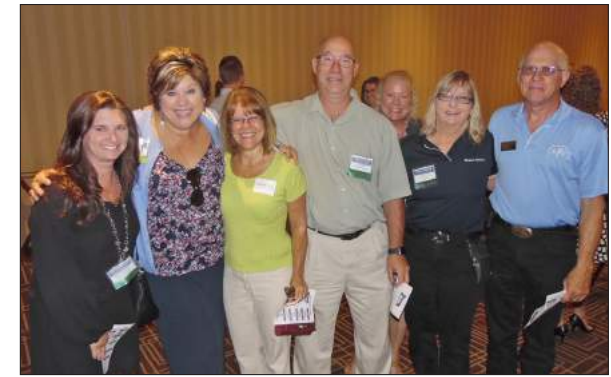
Game of Champions (Superbowl LII)