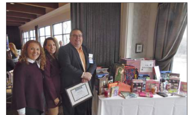
Toys for Joy Donation at Annual Meeting