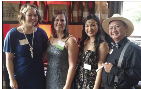
A Grand Speakeasy Gala