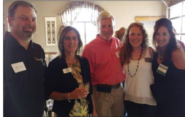
Acapulco Andover Wine Dinner