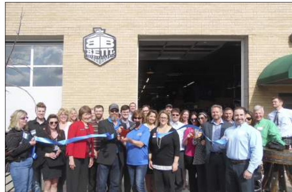
Ribbon cutting at Bent Brewstillery

The Ambassadors , 36 members strong, held 4 new member receptions – thank you Q-Bitez, Two Stooges, Chanticlear Pizza & San Jose Mexican Restaurant for hosting. They also conducted 32 ribbon cuttings and made dozens of welcome and retention calls throughout the year.