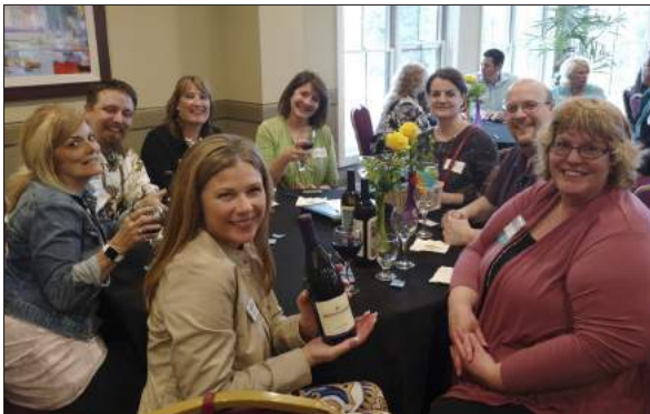
Tria Wine Tasting with White Bear Lake Chamber