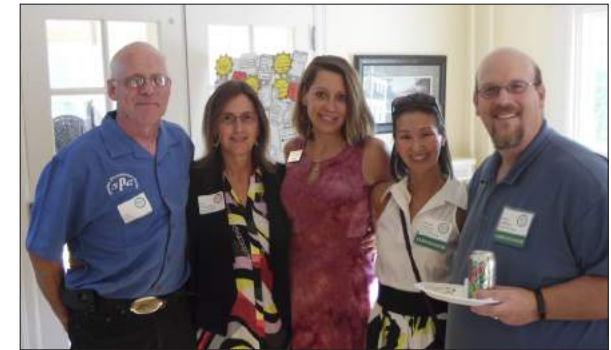
Membership Appreciation Party