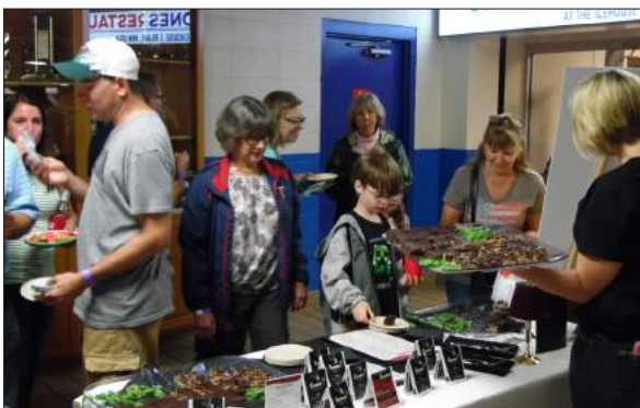
An Indoor Summer Food Fest