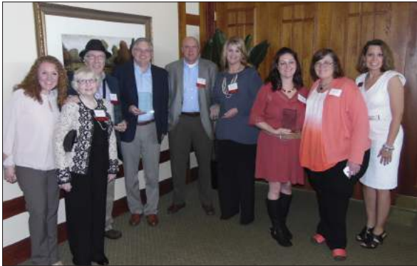
Excellence in Business Awards