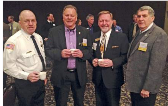
2016 Legislative Reception